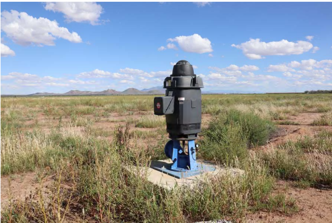
West irrigation well 55-927158