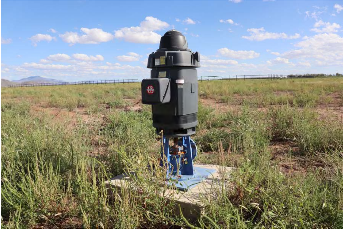
East well 55-927157