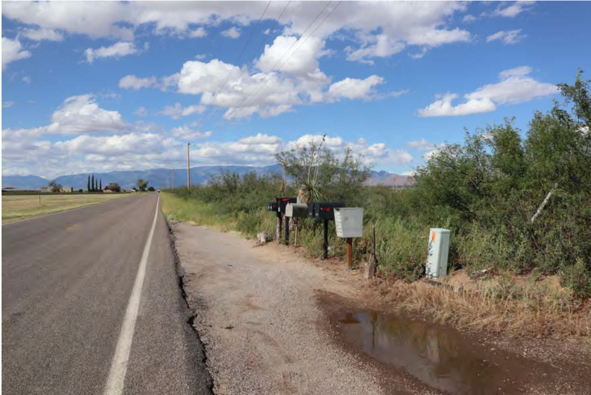
North view of Fort Grant Road from southwest corner