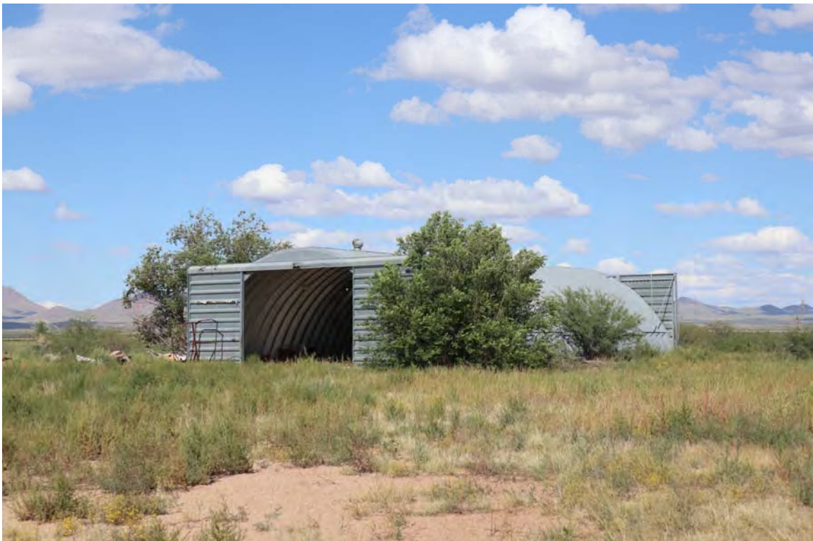
Quonset barn storage building.